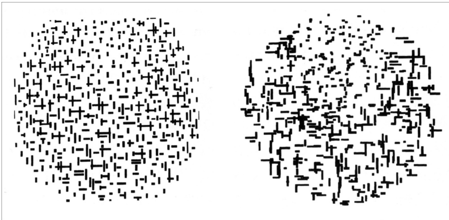
Fig. 2 P. Mondrian “Composition With Lines”, 1917; A. Michael Noll “Computer Composition With Lines”, 1965 (© Rijkmuseum, © A. Michael Noll)

scheme or program in producing the painting although the exact algorithm is unknown. A digital computer and microfilm plotter were used to produce a semi-random picture “Computer Composition With Lines” similar in composition to Piet Mondrian’s painting “Composition With Lines” (1917). Reproductions of both pictures were then presented to 100 subjects whose task was to identify the computer picture and to indicate which picture they preferred. Only 28% of the subjects were able to correctly identify the computer-generated picture, while 59% of the subjects preferred the computer-generated picture. Both percentages were statistically different (0.05 level) from selections based upon chance according to a binomial test.” [10]