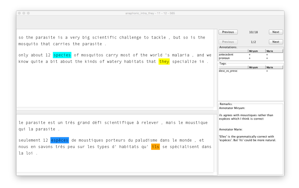
Fig. 3. Translation window with overview panel